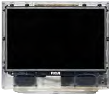
4520, 4520R, 4521, 4521R