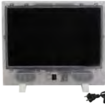
4460, 4460R, 4462, 4462R